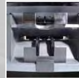
Extra reject pocket for non-interruption note processing.