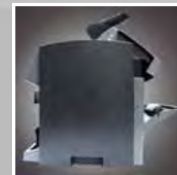
Easy opening bill path for fast paper jam removal and daily maintenance.