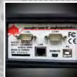
Full range of I/O port