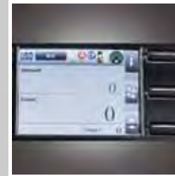
Large TFT display with MA unitized interface design, easy to use