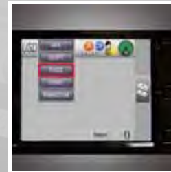
Compact two pocket machine with various sorting function: DD, Face, Orientation and Emission.