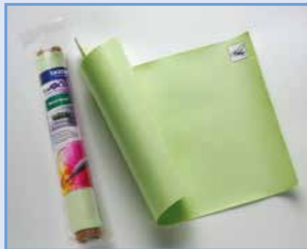
5. Stamp starter kit