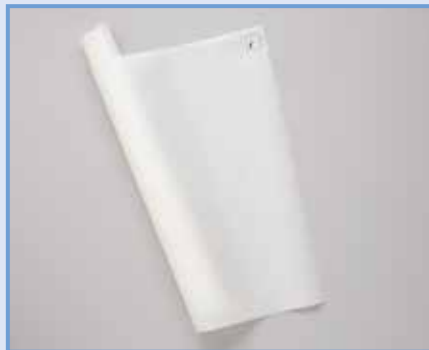
3. Iron-on fabric applique contact sheet