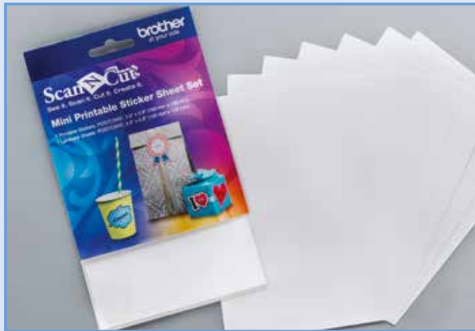
1. Printable sticker starter kit