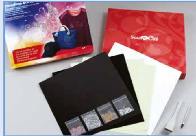
2. Rhinestone starter kit