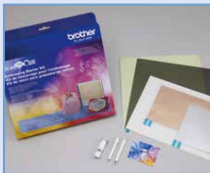
6. Embossing kit