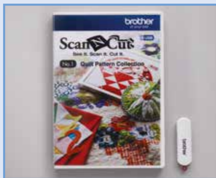
8. Quilt pattern collection