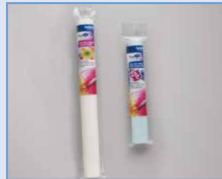
4. High tack fabric support sheet