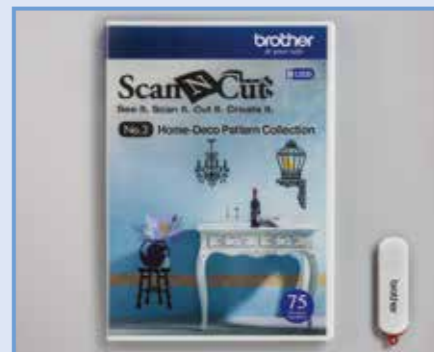
10. Home-deco pattern collection