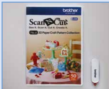
11. 3D paper craft pattern collection