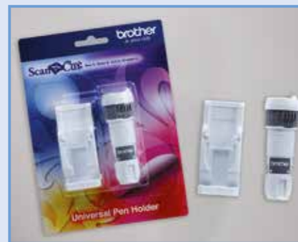
7. Universal pen holder