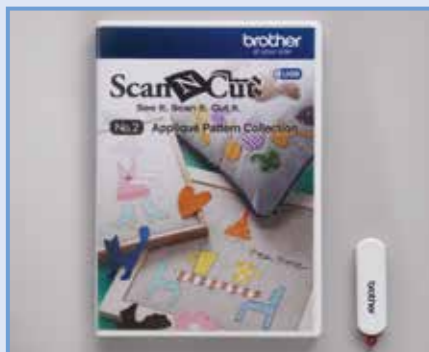
9. Applique pattern collection